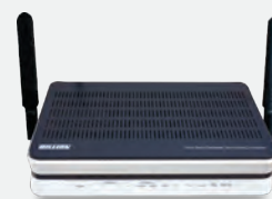
BILLION - BIPAC7800NXL