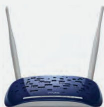
TP LINK - TD-W8960N